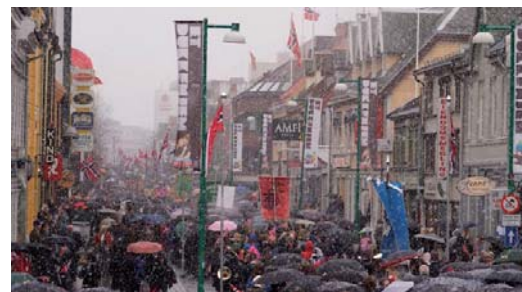
National holiday to Tromsø, the day of the departure